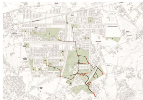
The water system ↔ The path system | diagrammatic plant

Finally, an important step, which also comes with difficulty and with a slight delay, has been made: the project of water and paths has been realized. It is one of the elements that make up the landscape plan, but also essential information to better organize the cultivation plan.