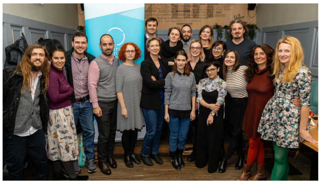
The first edition of the Culturepreneurs programme was launched in 2018. Here are the winners of the second edition held in 2019.