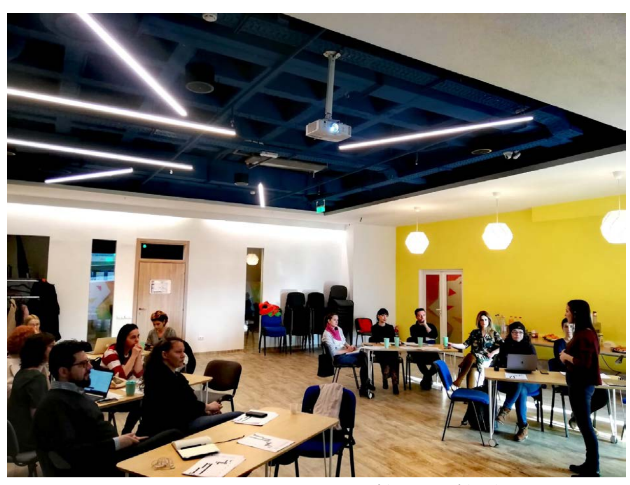
One of the meetings of the Culturepreneurs programme.