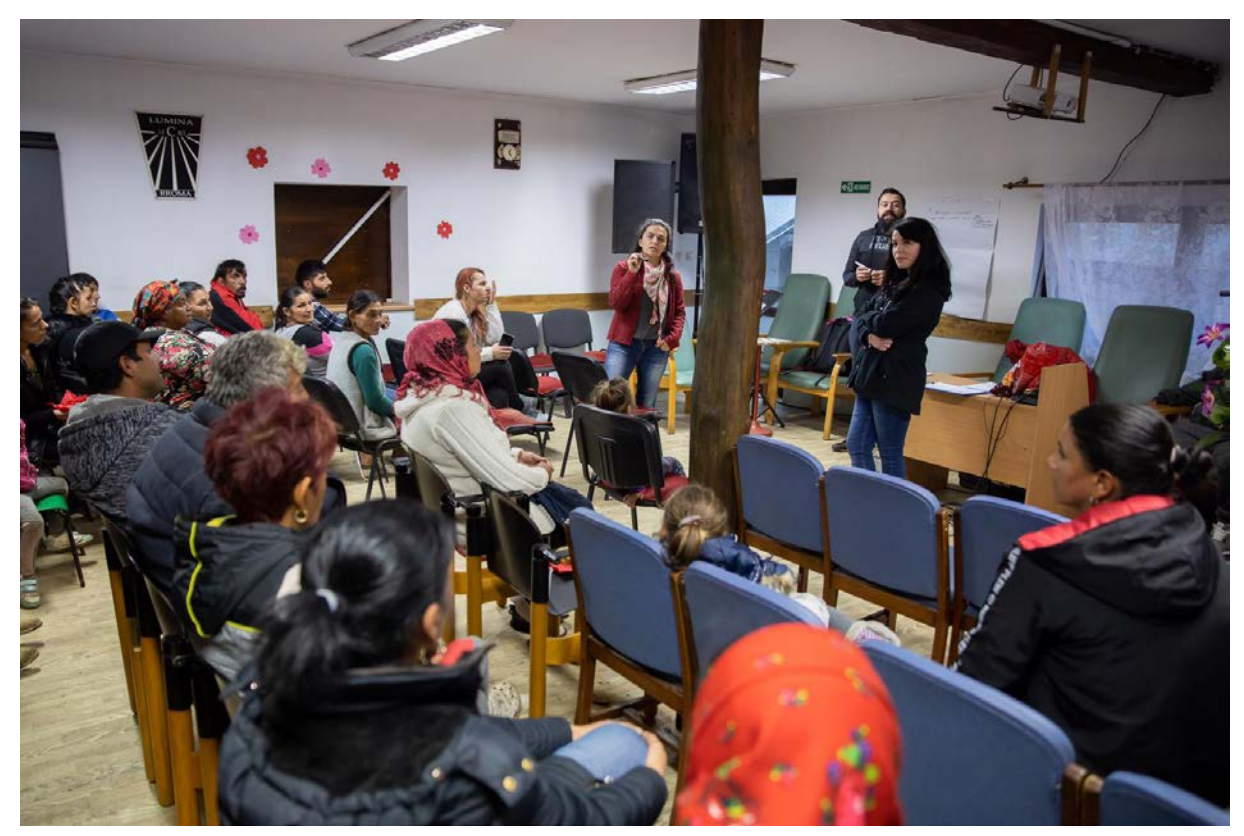
The first community meeting in Pata Rât.

by the local Roma community, such as the lack of public transport to the city centre and the need for better access to education and skill development activities. Around 30 residents of Pata Rât took part to the first community meeting, with the objective of discussing ideas and priorities for the participatory budgeting process, starting in the first months of 2020.