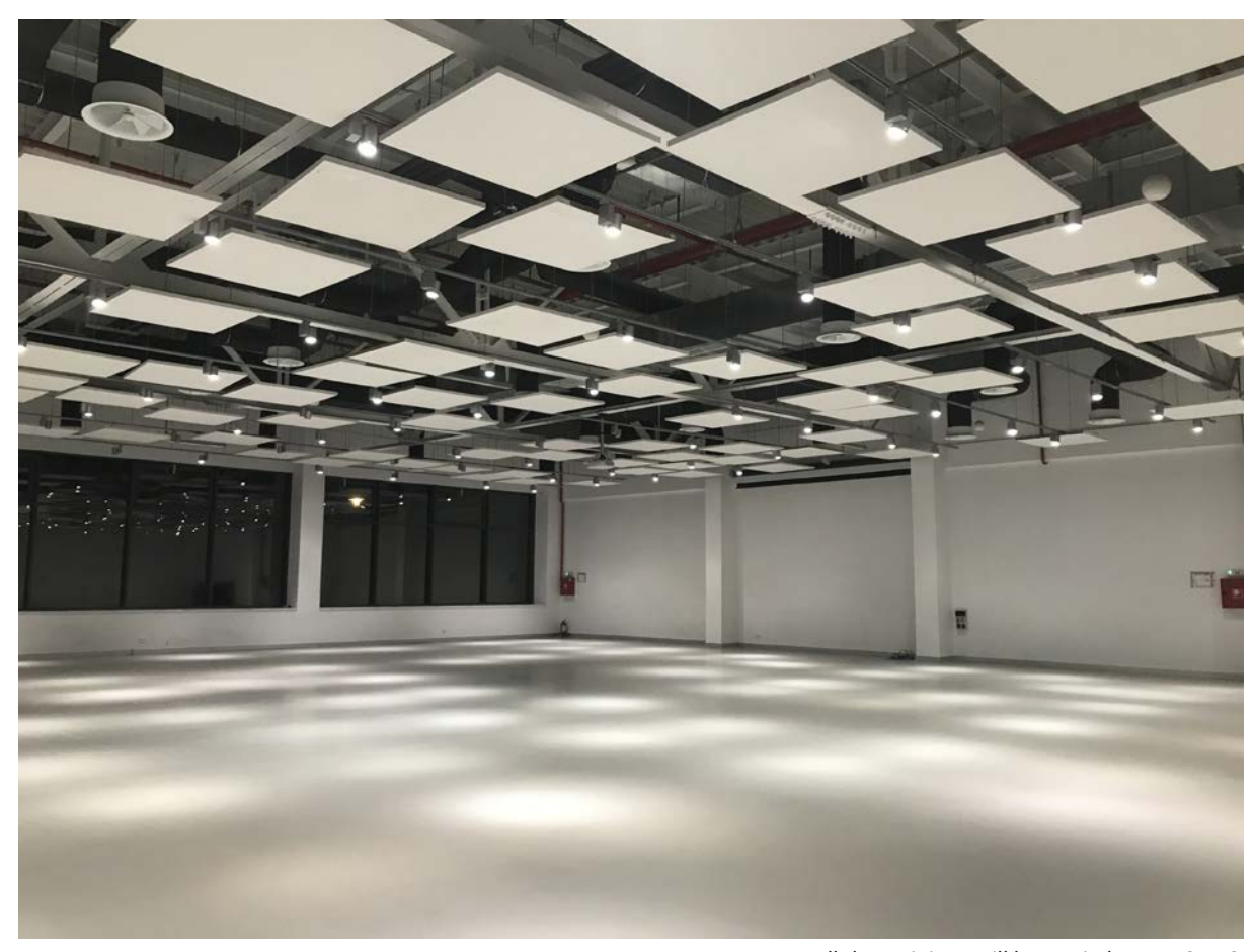
All the trainings will be carried out at CREIC: Source: UIA Expert

companies member of the thematic clusters which are delivery partners of Cluj Future of Work. This part of the project will also prototype future local value added chains and will show how reskilled workers can effectively contribute to innovate functions in the context where they work.