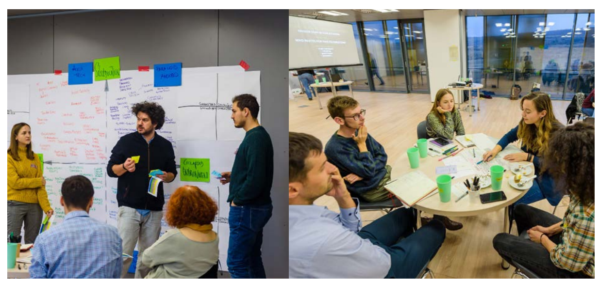
The first future scenario planning workshop involved artists, cultural operators and students

In view of the launch of the call for participants to the first round of Culturepreneurs, many delivery partners (Cluj Cultural Centre, Transilvania IT, Cluj IT Cluster, University of Art and Design of Cluj Napoca and Romanian Film Promotion, while Transylvanian Furniture Cluster just for Work 4.0) started to define the curricula and the modules that will be delivered to the participants. The partners contributed also to identify and to list all the equipment to be purchased by the City of Cluj-Napoca for the Film Lab, Design Lab and Work 4.0 Lab hosted by CREIC, where a cospace for participants working Culturepreneurs programme has already been equipped and the preparation of the spaces for the Labs has just started.