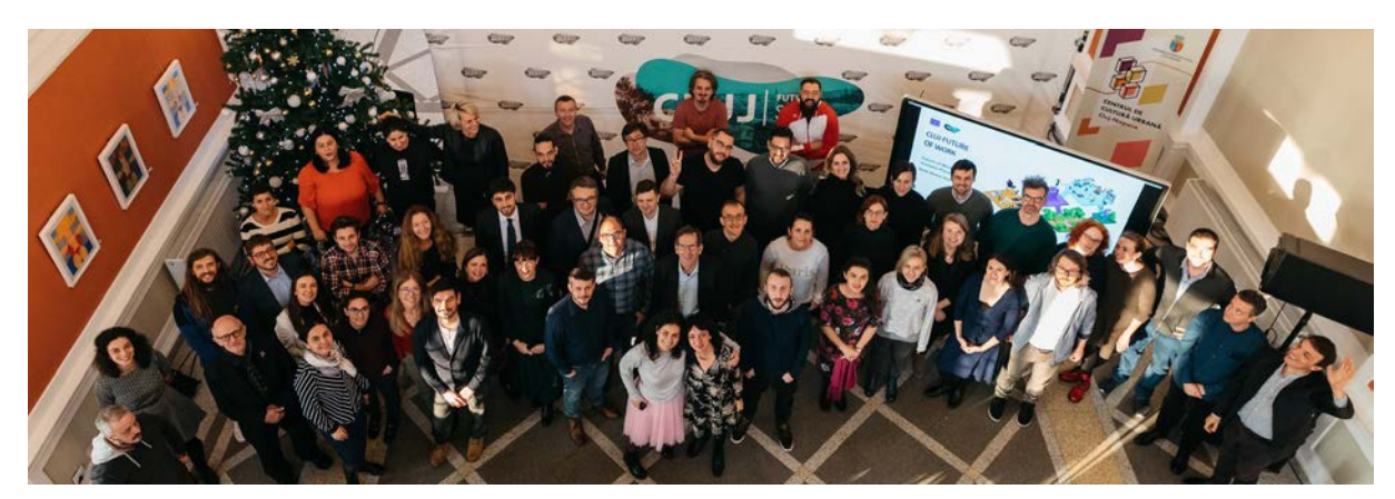
The partners of Future of Work.

involving project's beneficiaries in a collaborative, imaginary effort which contributes to shape the narrative of future of work. Clui Future of Work is an integrated project with a strong and committed partnership at local level. The project has a potential impact which goes far beyond the limits of Cluj-Napoca but can offer interesting solutions to improve the employability of specific categories, raises the role of culture at urban level and reacts in an effective way to the changes brought by automation. Its focus on categories which are contributing in very different ways to local economy, from artists to informal workers, makes Cluj Future of Work an interesting example of creative thinking applied to the contrast to inequalities and to the creation of relations of trust and community spirit at local level.