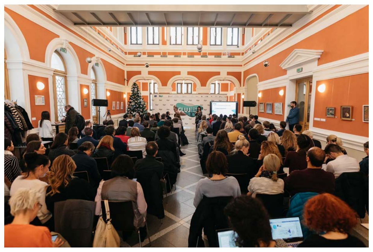
The Cluj Future of Work Conference took place in Cluj-Napoca on 6 December 2019.