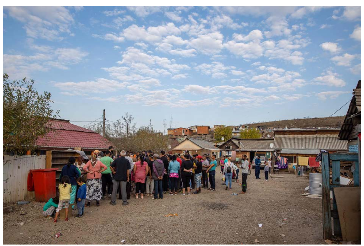
Community gathering in Pata Rât.

A participatory process in the area, with the identification of target groups and a community facilitation made by cultural mediators issued by the community itself, will lead to a participatory budgeting process which will select and finance four small entrepreneurial activities constituting an alternative to the informal work. The solutions tested in the framework of Cluj Future of Work will offer significant elements to influence the local public policies about informal work and create concrete actions in favor of the residents of Pata Rât.